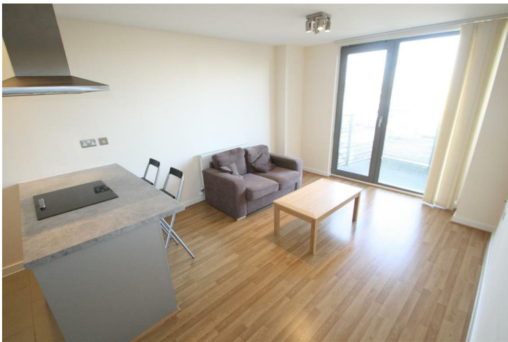
RECEPTION ROOM VIEW