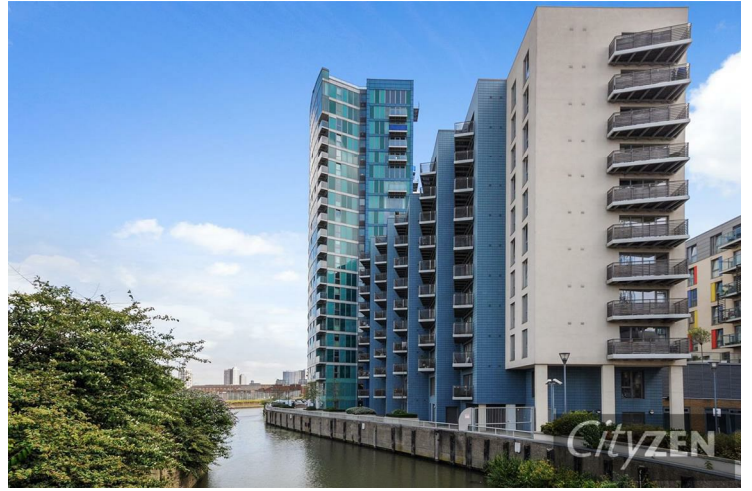
GEORGE HUDSON TOWER